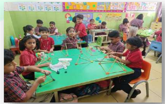
Prisms and Pyramids