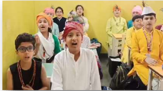
Doha Gayan – Kabir ke Swar