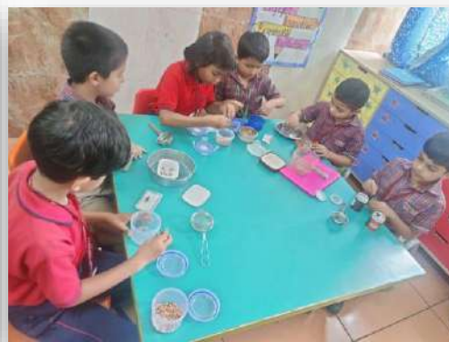
Hands on Learning