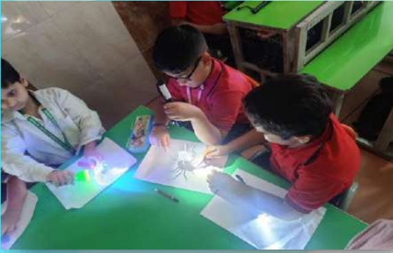
The Shadow Show

The Cambridge Spotlight promote creativity team work and holistic growth embedding the Cambridge learner attributes.