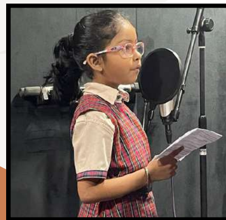
Visit to Recording Studio